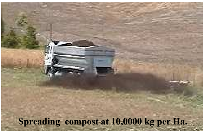
Spreading compost at 10,000 kg per Ha.